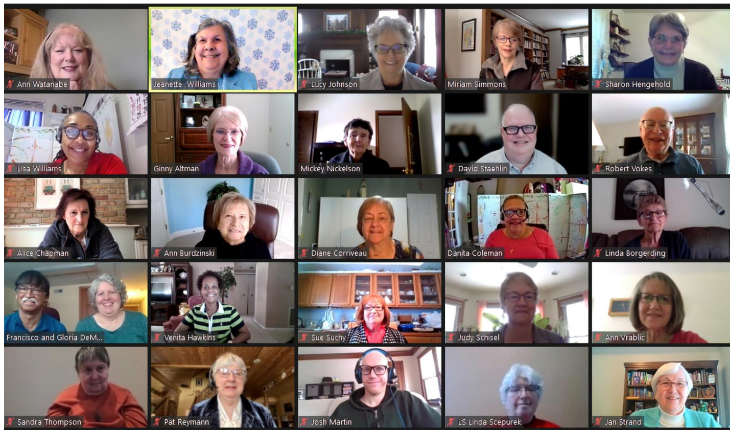
Some of the folks who participated in the Annual Seminar