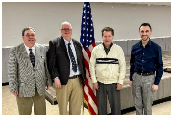
Convention Attendees on April 12 th