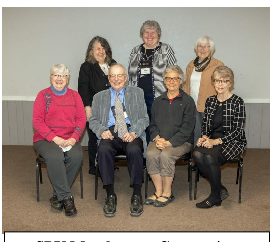
SPU Members at Convention