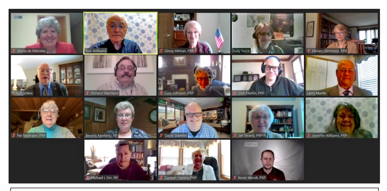
Convention Attendees on April 24th