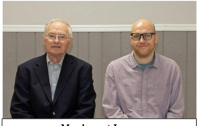
Members-at-Large at the Annual Convention