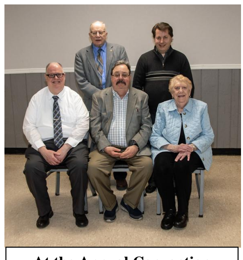
At the Annual Convention